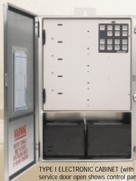
TYPE I ELECTRONIC CABINET (with service door open shows control panel and battery tray with optional batteries).