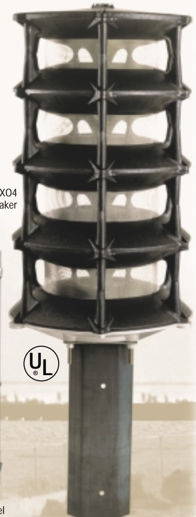
VORTEXO4 4 cell speaker